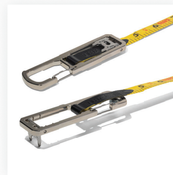
True Zero Dual carabiner and hook with same zero for simplified measuring