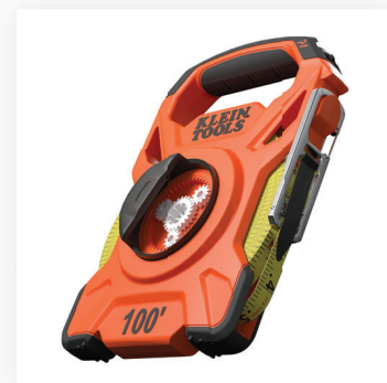
3:1 Gear Ratio For quick blade return